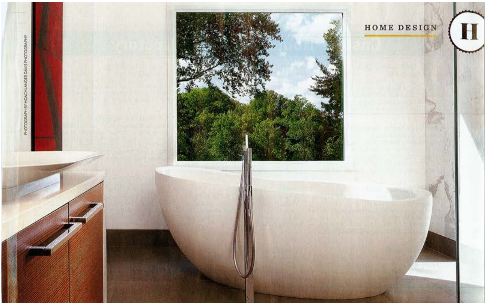
Using subdued colors in this Potomac bathroom made the view out the oversize window the star.