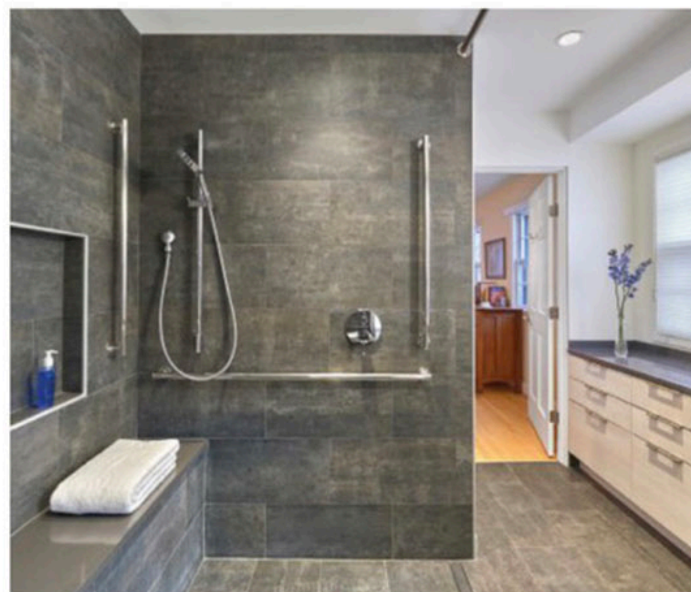
Hill & Hurr Architects (left)

Design elements include shallow-depth pine cabinetry and quartz counter, an extended sink basin for an easy reach, and low-maintenance LED lighting in and around the medicine cabinet mirrors. A self-sanitizing bidet-combo toilet and thermostatic hand shower allow for effortless bathing and cleaning. Careful procurement of accessible yet attractive materials—including sleek chrome grab bars; a luxurious, weighty shower curtain; and overhead rain shower head—keeps this spacious bathroom feeling resort-like instead of clinical.— Erin Ansley