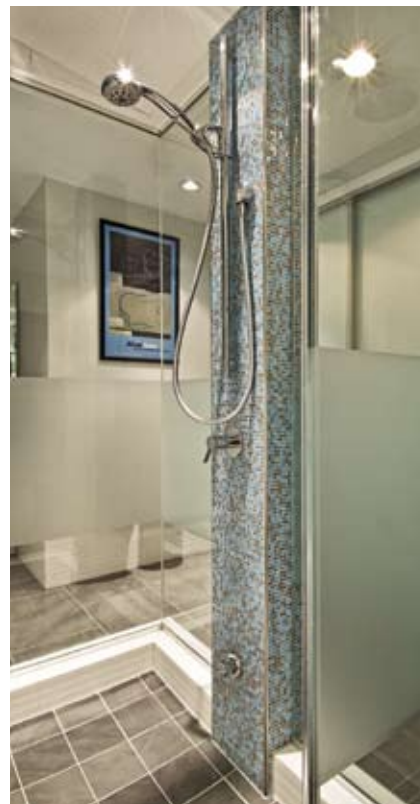
The mosaic tiled "shower tower" was a solution for moving the plumbing off the exterior wall to avoid frozen pipes in winter.

>> For more Solutions, visit www.ProRemodeler.com/solutions