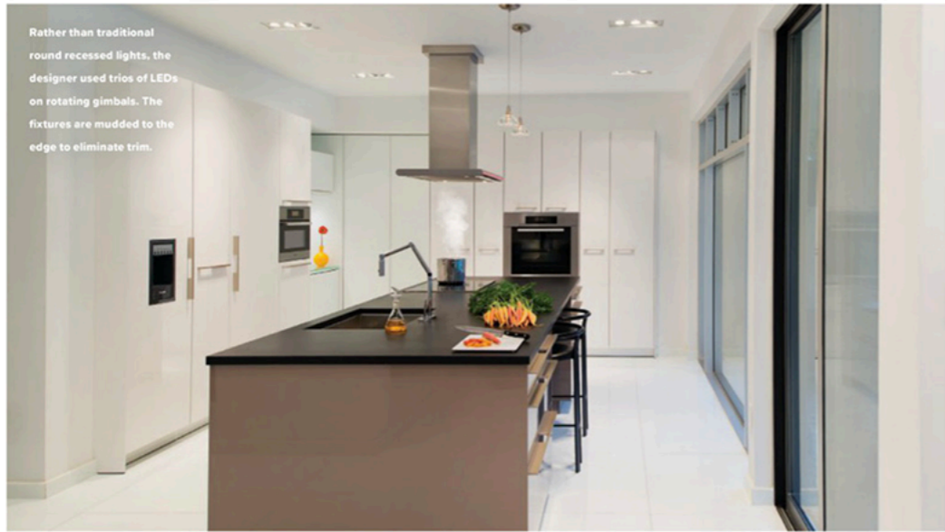
Rather than traditional round recessed lights, the designer used trios of LEDs on rotating gimbals. The fixtures are mudded to the edge to eliminate trim.