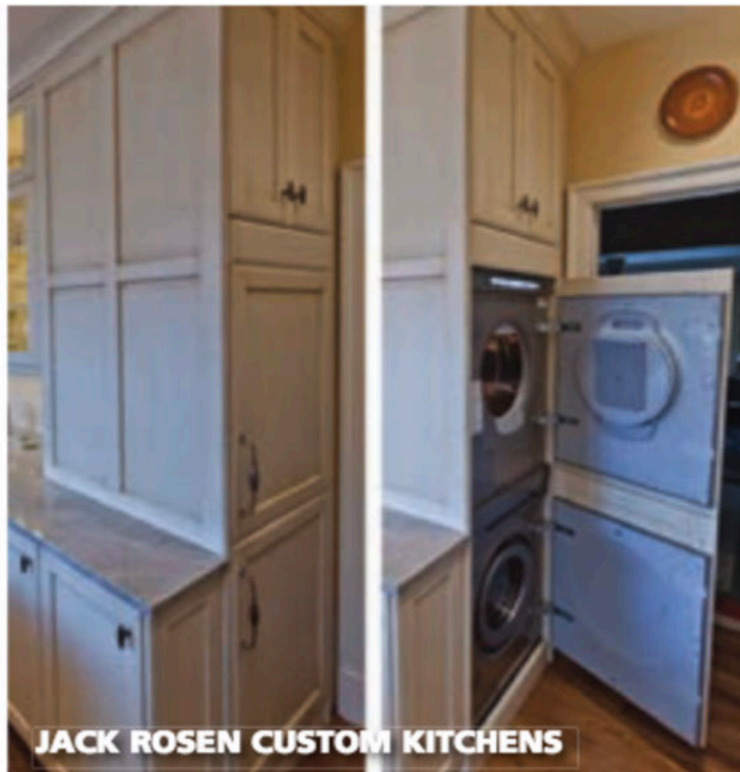
JACK ROSEN CUSTOM KITCHENS