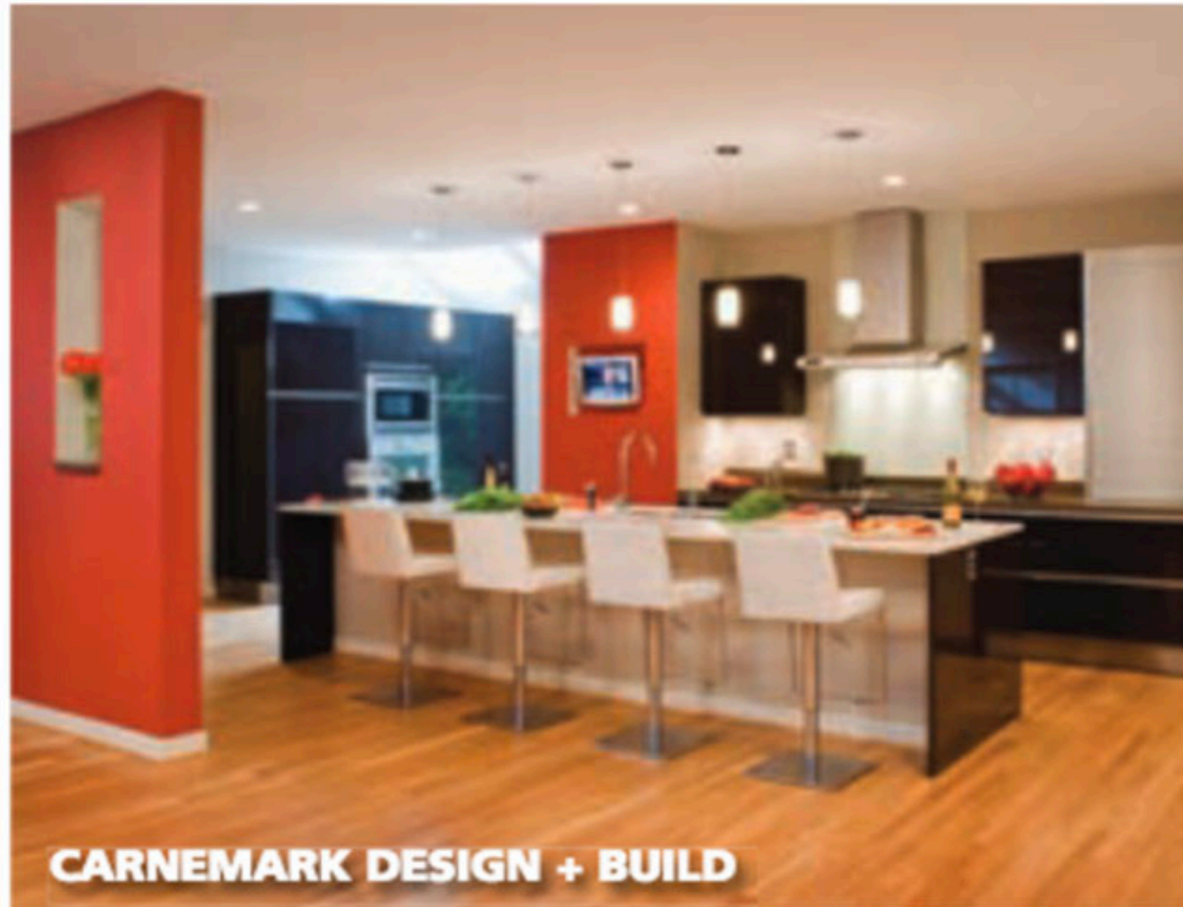
CARNEMARK DESIGN + BUILD