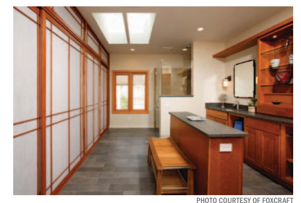
Above: Accurate Industries, Wheeling, Ill., winner of the Best Residential Specialty Item. At left: Foxcraft, Falls Church, Va. winner of the Best Bath Remodel Over $60,000.